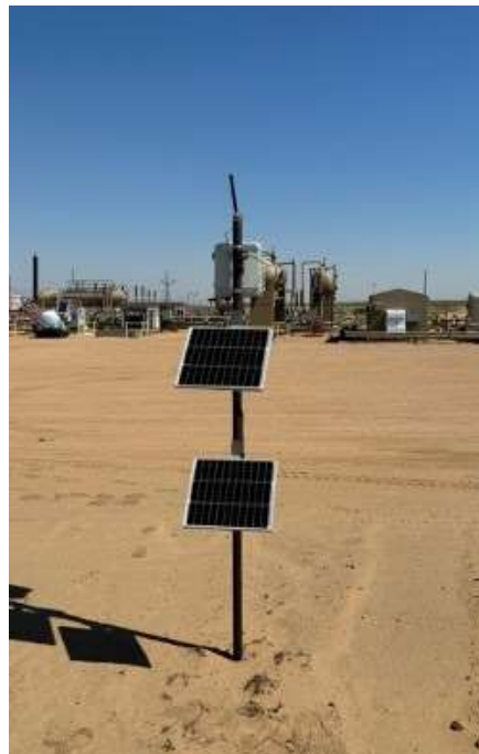
Figure 2: Canary X Device Field Installation

Each Canary X device is secured on a pre-installed metal pole, approximately 6 feet above the ground, with metal clamps and bracket hooks to ensure a stable installation. One or more solar panels are mounted on each pole, externally to each device, depending on geographical area and average solar radiation. A Canary X device installation is shown in Figure 2.