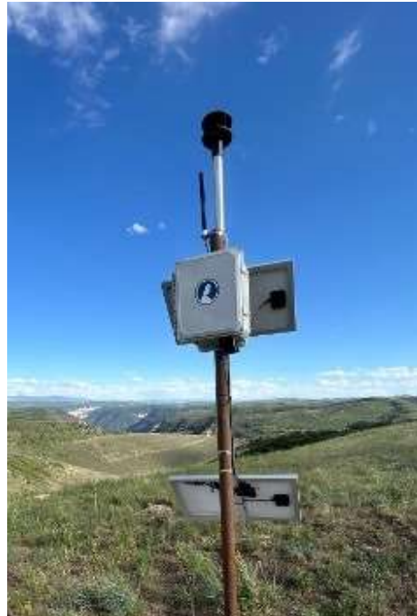
Figure 3: Canary X Anemometer Mount

Project Canary's Siting Tool, detailed in Section 2.2, optimizes sensor placement for the most effective leak detection and determines where mounting poles must be placed. Operators are required to properly install and place poles prior to the arrival of Project Canary field personnel for Canary X device installation.